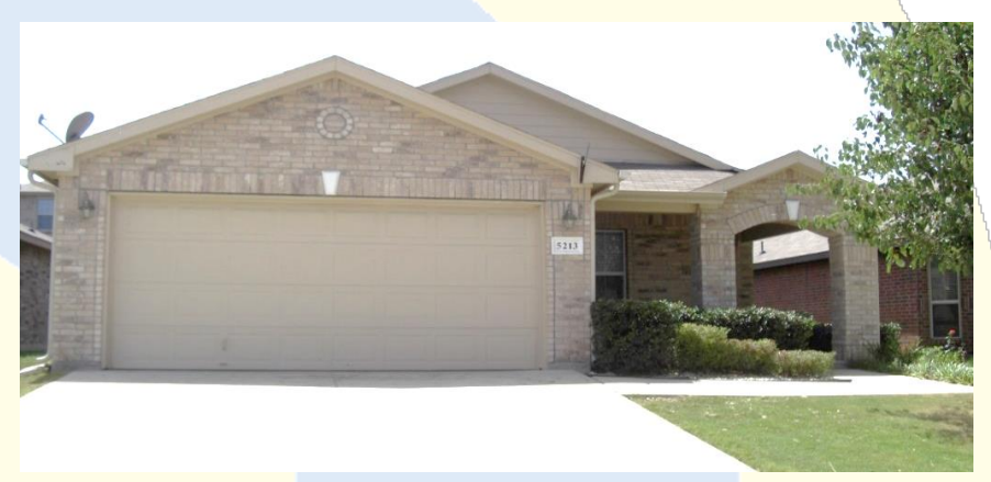
Ft. Worth Purchase $100k / ARV $135k